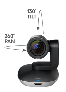
GROUP features a 260° pan range and the ability to tilt 130°, which provides an extra-wide visual range when meeting with mid-sized groups.

Logitech was an early adopter of the H.264 video compression format. The high video quality achievable through a combination of H.264 compression, precision optics, and advanced engineering creates a realistic user experience during video conferences that ultimately leads to better meetings.