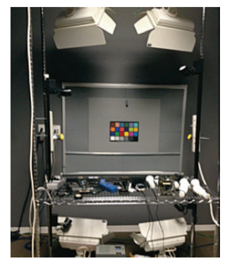
Logitech's automated image quality test bench measures optical performance under controlled lighting conditions ranging from fluorescent to daylight to ensure color accuracy

Logitech aspired to address each of these goals with the launch of the ConferenceCam category. From the original ConferenceCam BCC950 to the portable ConferenceCam Connect to the recently launched