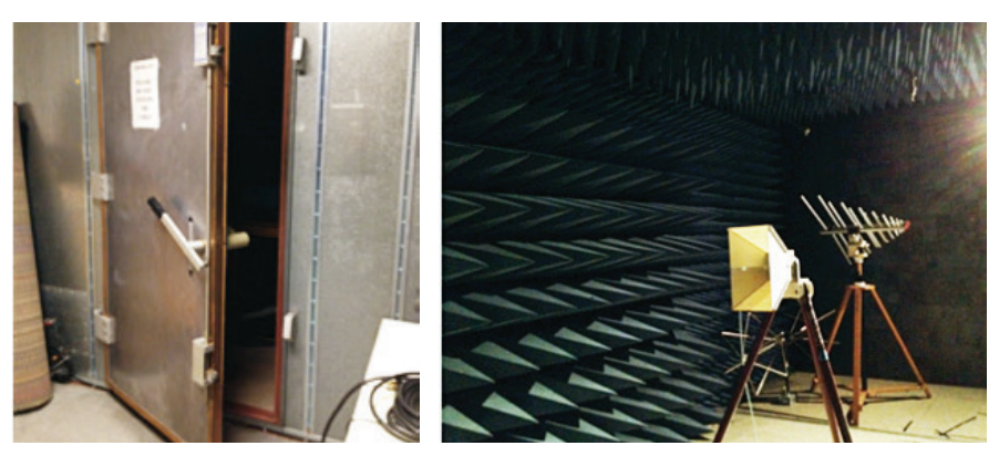
Beyond the door to this EMC chamber, Logitech performs tests to ensure compliance with international electromagnetic emission standards.

With ConferenceCam Connect, Logitech has introduced the ability to display content from a mobile device onto whatever HDMI-enabled screen