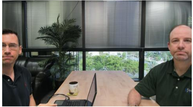
Logitech BRIO Webcam (90 degree FOV)