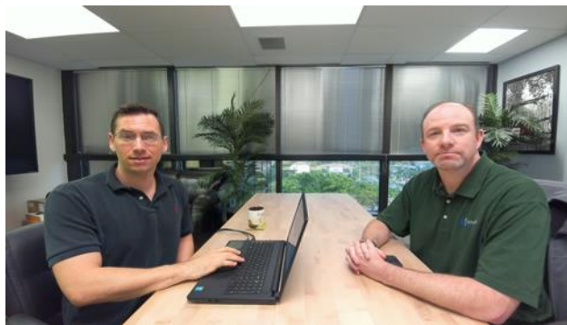
Logitech MeetUp ConferenceCam (120 degree FOV)

In the three images above, the local participants are seated ~ 36 inches away from the camera. The only difference is the camera in use to capture the local participants. While all three cameras are providing a high quality experience, the above highlights the importance of a camera's field-of-view when used in small meeting spaces.