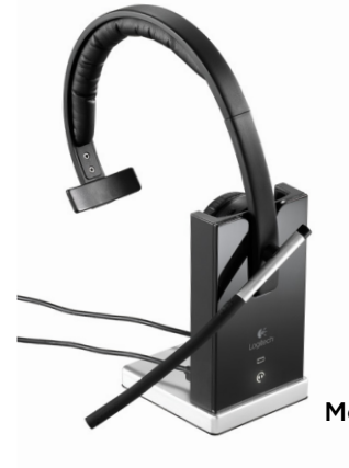
Mono (in dock)