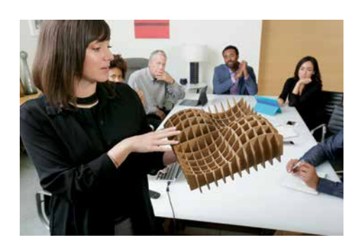
For razor sharp close-ups of objects and whiteboard content, the GROUP camera offers 10x lossless zoom enabling your team to see every detail with outstanding resolution and clarity.

GROUP offers the flexibility to customize conference room set-up with multiple camera mounting options. Use the camera on the table or mount it on the wall with included hardware. The bottom of the camera is designed with a standard tripod thread for added versatility. Conference participants can also clearly converse within a 6m/20' diameter around the base, or extend the range to 8.5m/28' with optional expansion mics.