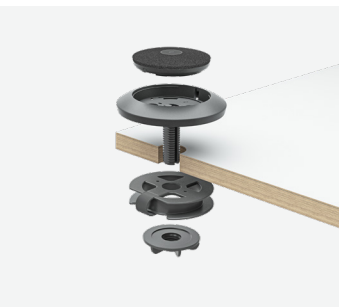
RALLY MIC POD MOUNT

Connect up to three Rally Mic Pods for hub-and-spoke layouts and to minimize cabling. Included with the large room configuration.