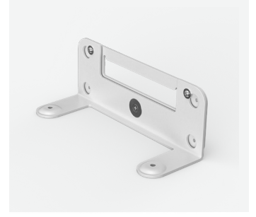
WALL MOUNT FOR VIDEO BARS

Float Rally Bar Mini or Rally Bar above or below the room's display.