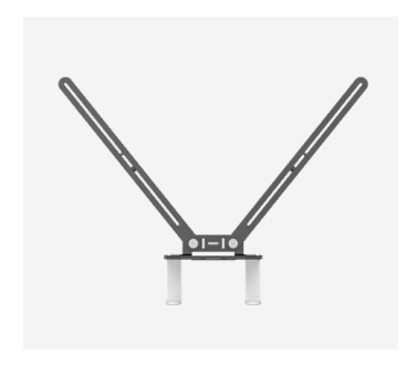
TV MOUNT FOR VIDEO BARS

Float Rally Bar Mini or Rally Bar above or below the room's display.