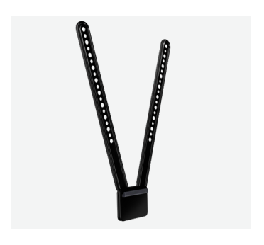
TV MOUNT FOR MEETUP 2

Mount Rally Bar Mini or Rally Bar on the wall for minimal footprint.