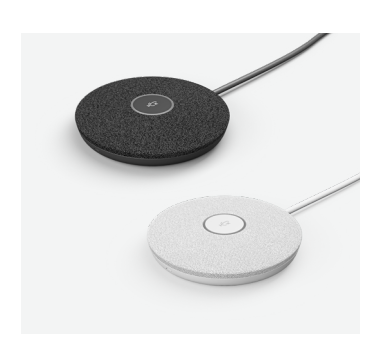
RALLY MIC POD

Secure PC and cables to walls and beneath tables with integrated cable retention.