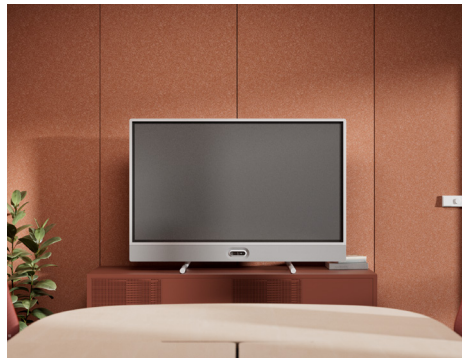
Table stand with camera below