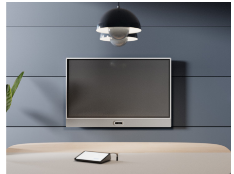
Wall mount with camera below

Designed for flexibility, Rally Board 65 is made for the way you meet. It works seamlessly with leading platforms like Microsoft Teams, Zoom, and Google Meet* in Android, PC, or BYOD mode, so you can easily adapt Rally Board 65 for current and future needs. Plus, it provides multiple mounting options**, so you can add it to any open space or meeting room. It's made to deploy with the camera above or below the screen to allow all participants to maintain natural eye contact in all spaces.