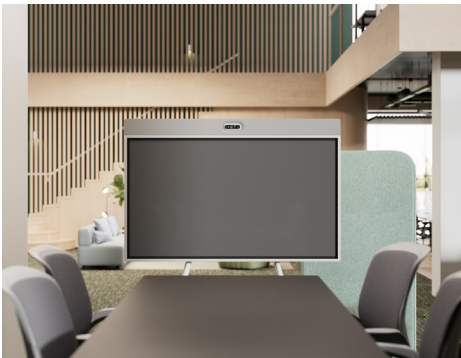
Cart with camera above