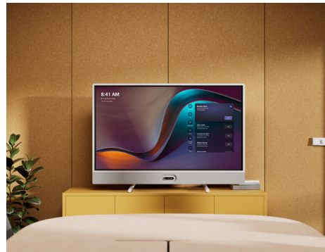
Table stand with camera below