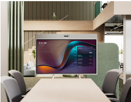
Cart with camera above