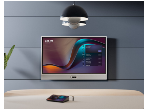
Wall mount with camera below

Designed for flexibility, Rally Board 65 is made for the way you meet. It's certified for Microsoft Teams Rooms on Android* so you can easily adapt Rally Board 65 for current and future needs. Plus, it provides multiple mounting options**, so you can add it to any open space or meeting room. It's made to deploy with the camera above or below the screen to allow all participants to maintain natural eye contact in all spaces.