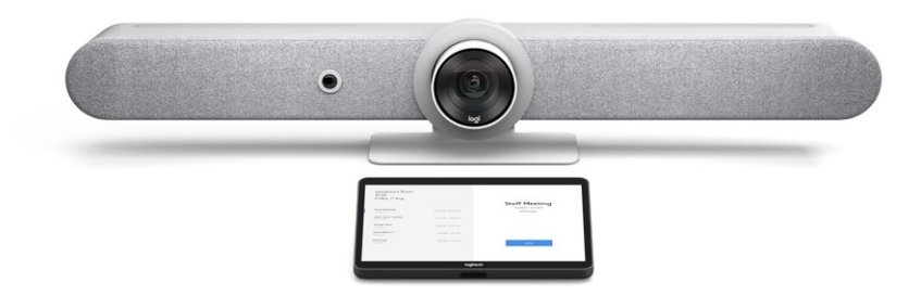
Shown with Logitech Rally Bar.