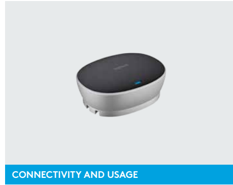
CONNECTIVITY AND USAGE

Simply plug the speakerphone into the powered hub with the supplied 4.9m/16' cable to get up and running in no time.